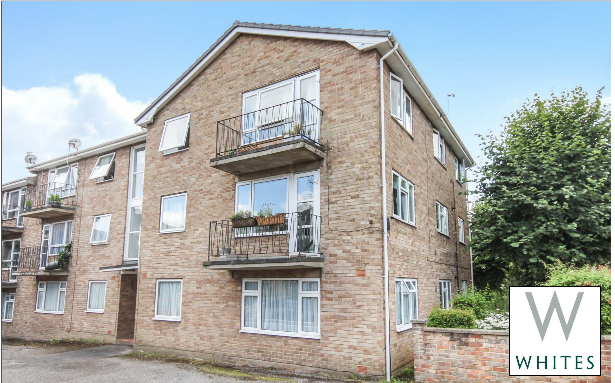
Flat 28 Cleveland Flats, Fairview Road, Salisbury, Wiltshire, SP1 1JY